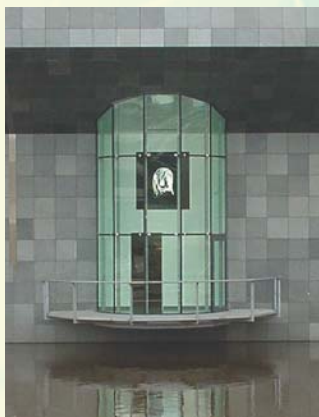
26. Pierre Huyghe & Philippe Parreno 'Skin of Light', 2001

Between 1999 and 2003 a community developed around AnnLee, an exchange of ideas, stories and manifestations. The project alludes to the function and working of registered brand names and logos and to the shaping of an identity and the issues surrounding authorship. Pierre Huyghe says of the contributing artists: 'They are simply the amplifiers of the echo AnnLee, an echo which they have not sent out themselves and which they do not own.' So AnnLee has become a signal, a living logo, and the 26 artworks (videos, paintings, objects, installations, posters, a sound work, a magazine and a publication) now form an 'imaginary film' featuring, about and around AnnLee.