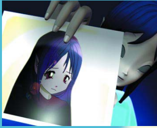
24. Richard Phillips 'AnnLee', 2002